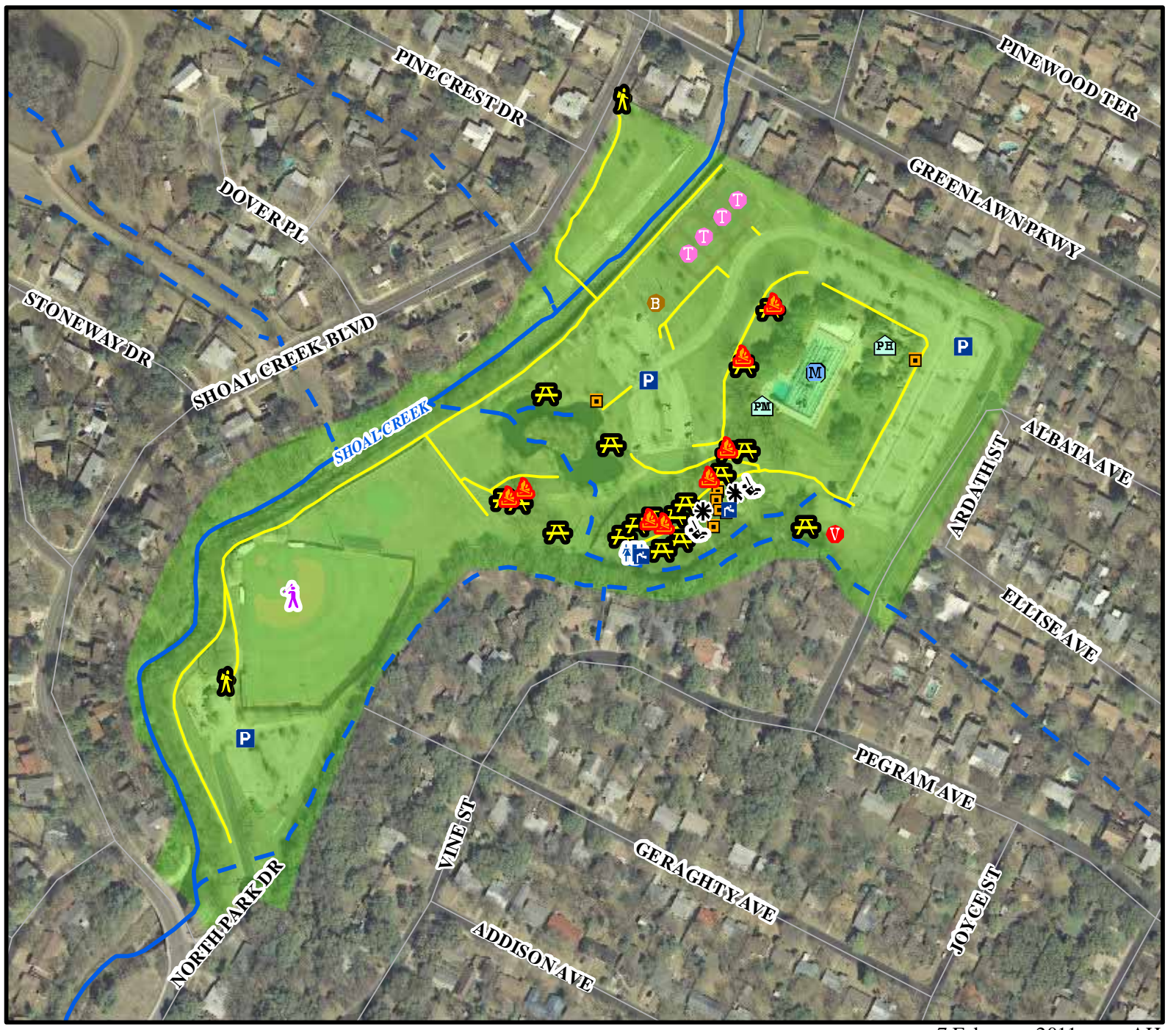
Beverly S. Sheffield Northwest District Park